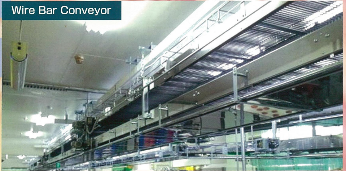
Wire Bar Conveyor