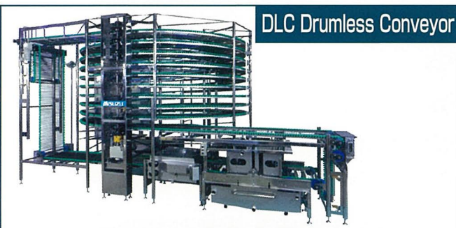
DLC Drumless Conveyor