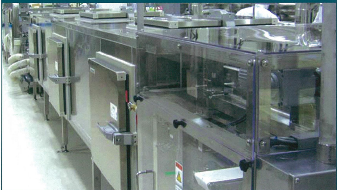
Cooling Tunnel Conveyor