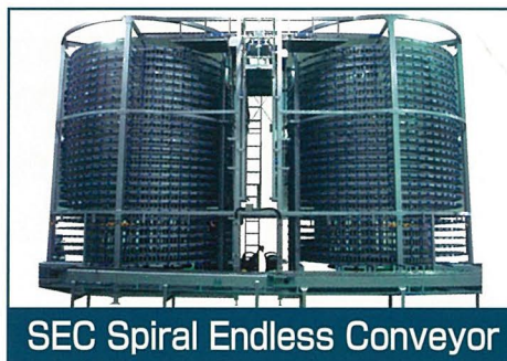
SEC Spiral Endless Conveyor