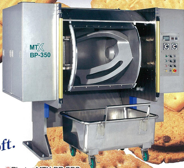
※Photo: MTX BP-350. Dough box is optional.

Small, high-speed Biscuit Mixer aimed at easy operation, easy cleaning and easy maintenance, available for a wide range of dough, from hard to soft.